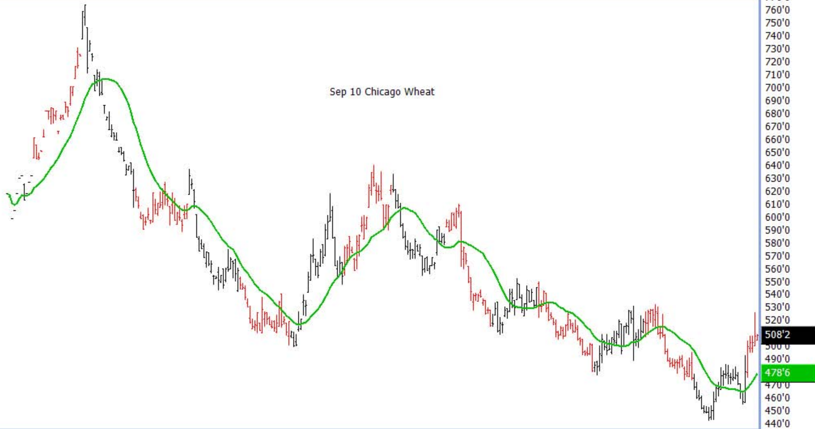
Sep 10 Chicago Wheat

770'0 750'0 740'0 730'0 720'0 710'0 700'0 690'0 680'0 670'0 660'0 650'0 640'0 630'0 620'0 610'0 600'0 590'0 580'0 570'0 560'0 550'0 540'0 530'0 520'0 508'2 500'0 490'0 478'6 470'0 460'0 450'0 440'0